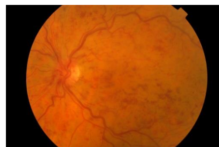
Figure 3- central retinal vein occlusion

2. Central retinal vein occlusion (CRVO) is due to obstruction of the main vein formed from the four branches which drain blood from the retina (see figure 3 below). In general, visual loss is more severe if the central retinal vein is occluded.